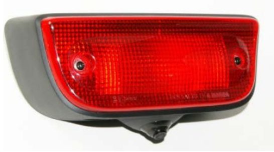
Camera (light not included)