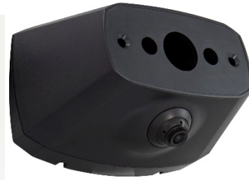
Camera, housing and mounting plate